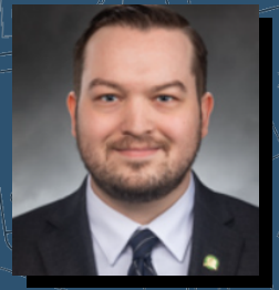
Rep. Travis Couture

Kidney disease affects an estimated 37 million people in the United States, and approximately 90% of those with kidney disease don't know they have it. With support from elected officials and the community, we can reduce kidney disease diagnoses, improve patient outcomes and pioneer new research that will inform best practices and innovative treatment methods for future generations. All data below is reported at a county level. More information and links to data sources are available at NWKidneyCouncil.org .