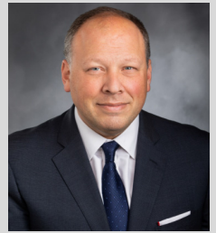
Sen. David Frockt