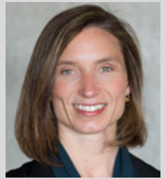
Rep. Maxine Dexter